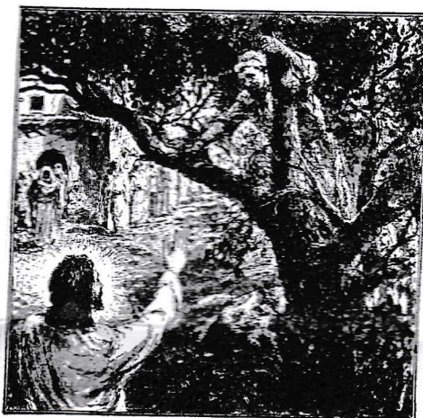
"TRYING to SEE JESUS"